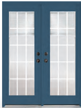
INTERNAL IG BLINDS