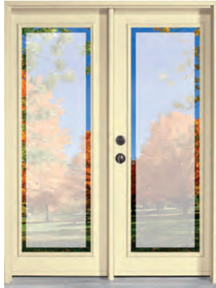
SANDBLAST WITH 1" CLEAR BORDER