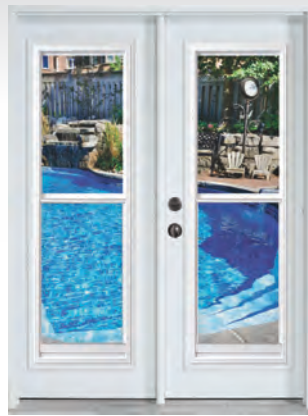
PRAIRIE FULL VENT