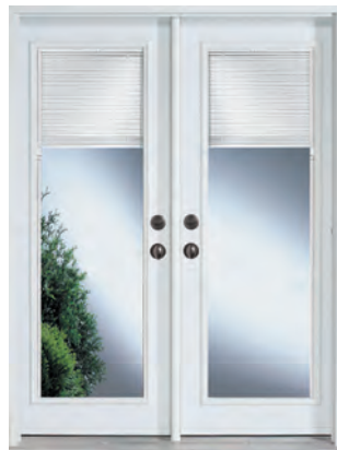
INTERNAL RAISE/LOWER BLINDS